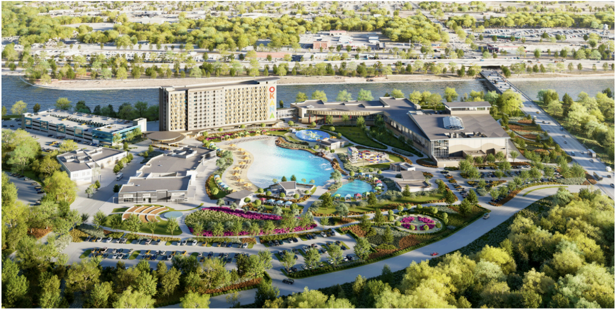
© OKANA Resort & Indoor Waterpark

Indoor and outdoor water attractions offer year-round fun, with the 100,000-square-foot indoor waterpark the largest in the region. Offerings include a wave pool, lazy river, luxury cabanas, adult-only pool, kiddie pool and 15 water slides. At the 4.5-acre outdoor adventure lagoon, find plunge pool body slide, an inflatable obstacle course, an adult-only swim-up bar and tanning pool, and the “fly” pool.